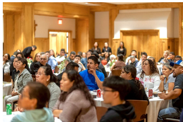
EOC