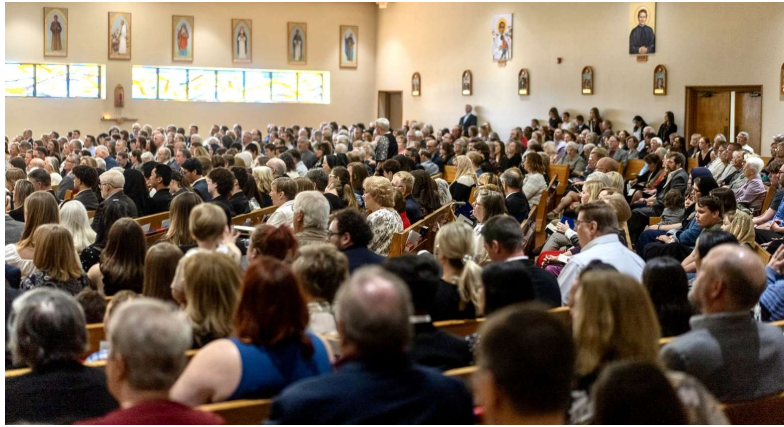
EOC