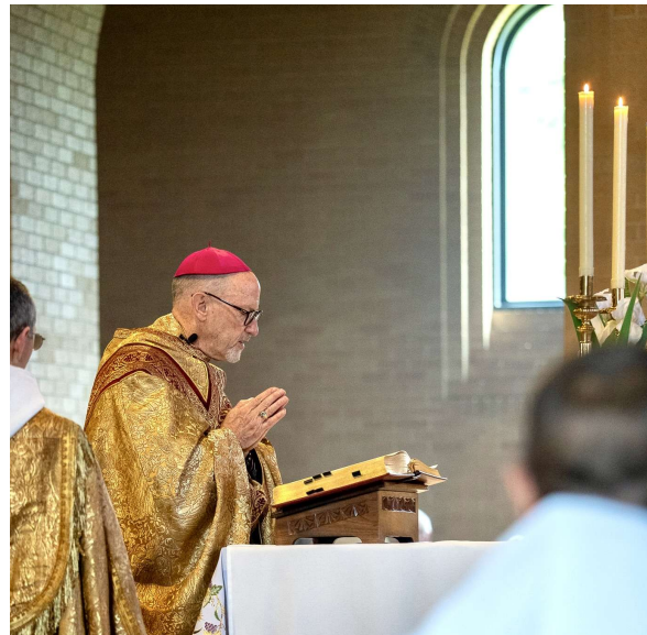
EOC