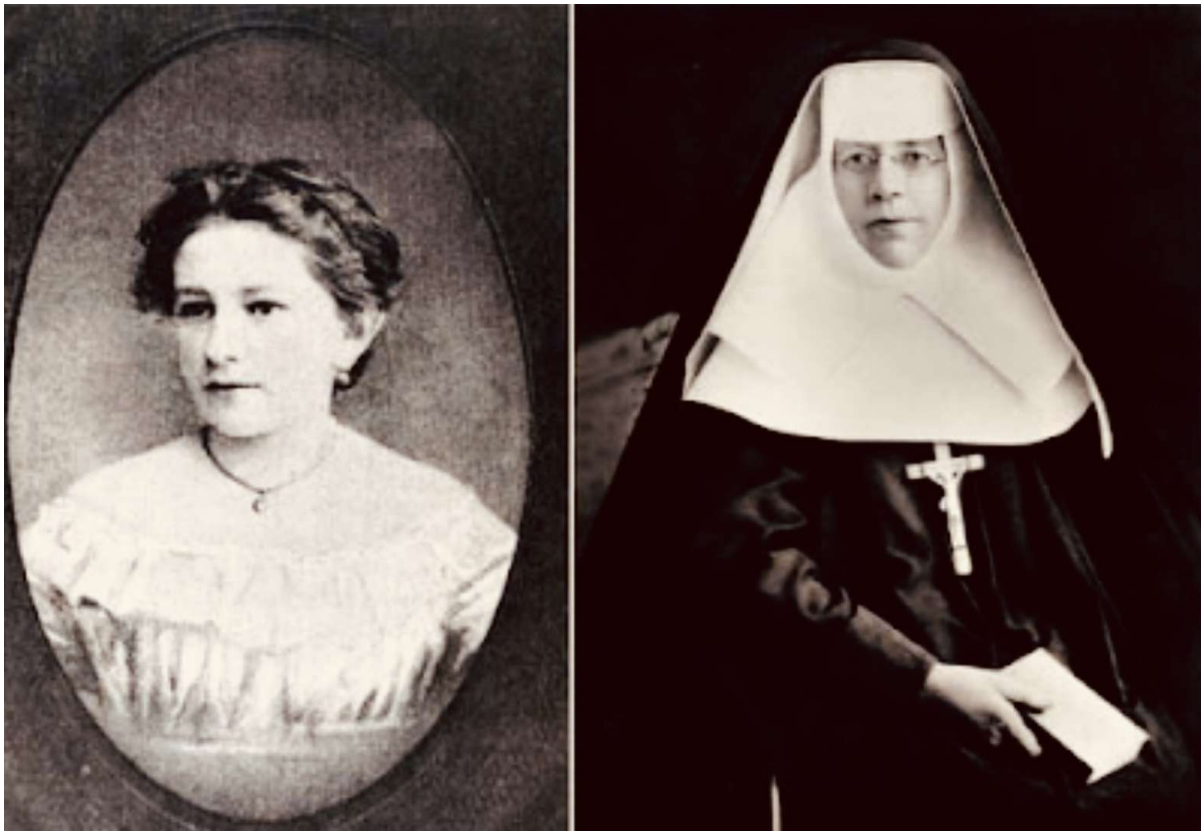
At left, the young heiress Katharine Drexel at age 16. At right Mother Katharine is pictured in the habit of the Sisters of the Blessed Sacrament, the religious order she founded.